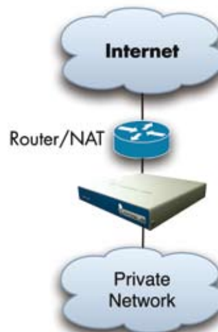
PRX Traffic Manager - Basic Deployment